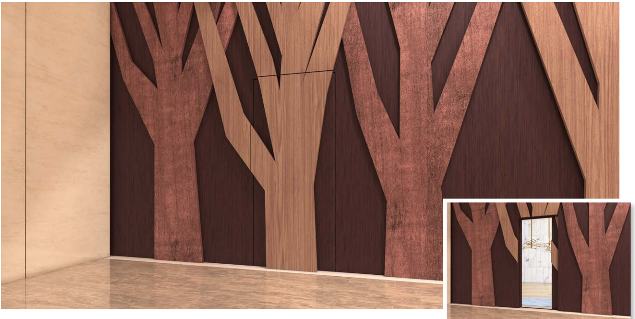
[Top Hung Sliding System]